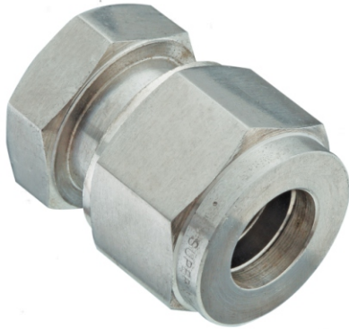
Dimensional Details :